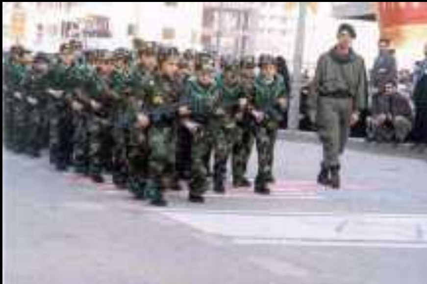
Palestinian children step on American and Israeli flags during military training camps.

The appearance of Palestinian children in these riots is not accidental. The Palestinian Authority has intentionally mobilized Palestinian children to man the front line in its struggle against Israel, frequently using them as shields to protect Palestinian gunmen. This mobilization of Palestinian youth has, moreover, been facilitated by the long-term impact of Palestinian Authority (PA) curricula, government-controlled media, and summer camp programs, which indoctrinated the youth for armed confrontation with Israel even prior to the current crisis.