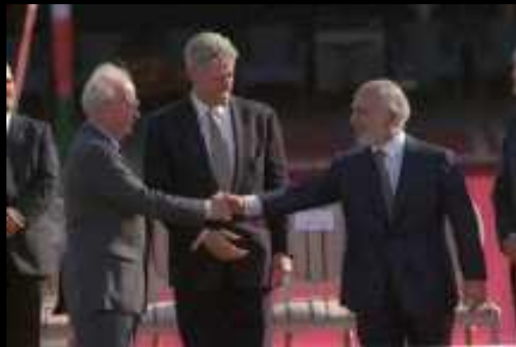
Israel's peace with Jordan