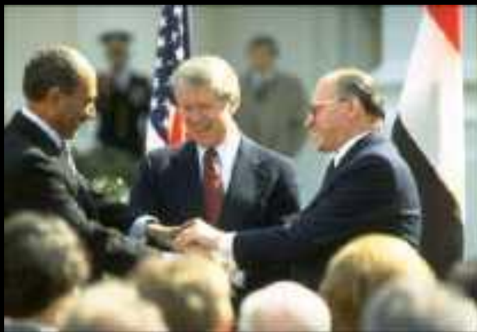
Israel's peace with Egypt